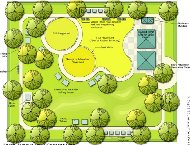
Larch Avenue Park Concept Plan The City of Lawndale - From Lot to Spot - The Trail for Public Land Statewide Park Development and Community Revitalization Program Application

The new 1.5 acre park will include community gathering spaces, picnic and shade structures, an amphitheater, and a restroom building with cantilevered viewing deck. The park will also include multiple play areas for people of all ages, outdoor exercise equipment, a climbing wall, and perimeter walking path. A rich California native plant palette including grasses, shrubs, and shade trees will help transform this vacant lot into a beautiful and new green space. To reduce the amount of storm water entering the storm drain system, and to provide storm water cleansing on site, there will be a bio-swale at the park perimeter.